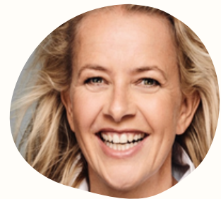
Princess Mabel van Oranje

ED, Georgetown Institute for Women, Peace & Security, Former Chief of Staff to Hillary Clinton