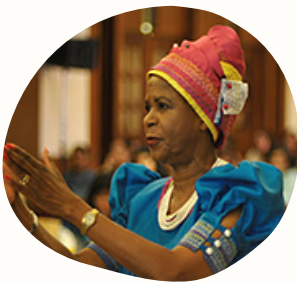
Dr. Mamphela Ramphela

South African apartheid activist, Former MD World Bank