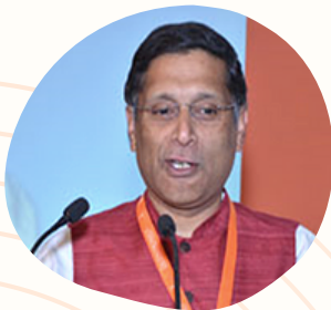
Dr. Arvind Subramanian

Global Advocate for freedom, justice & development; Social change entrepreneur; Board Chair of Girls Not Brides